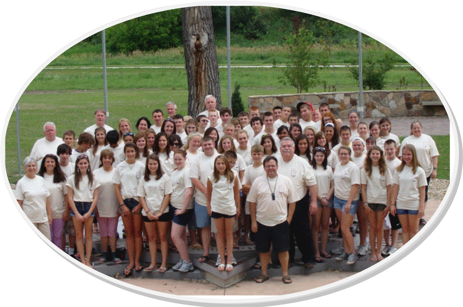
2011 Senior High Youth Group Mission Trip to South Dakota